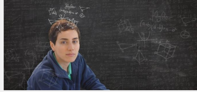
Maryam Mirzakhani, was an Iranian genius mathematician and the first-ever female winner of the prestigious Fields Medal (Nobel) prize for Mathematics.