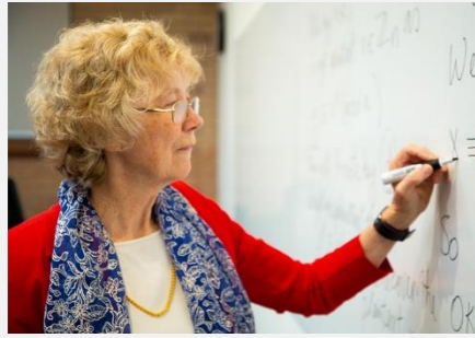
Emeritus Professor Cheryl Praeger Winner of the 2019 PM's Prize for Science First recipient of the inaugural Ruby Payne-Scott Medal in 2021 Companion of the Order of Australia for "eminent service to mathematics, and to tertiary education, as a leading academic and researcher, to international organisations, and as a champion of women in STEM careers" (2021).