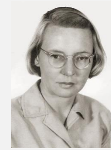
Ruby Violet Payne-Scott (28 May 1912 – 25 May 1981) was an Australian pioneer in radiophysics and radio astronomy, and was the first female radio astronomer